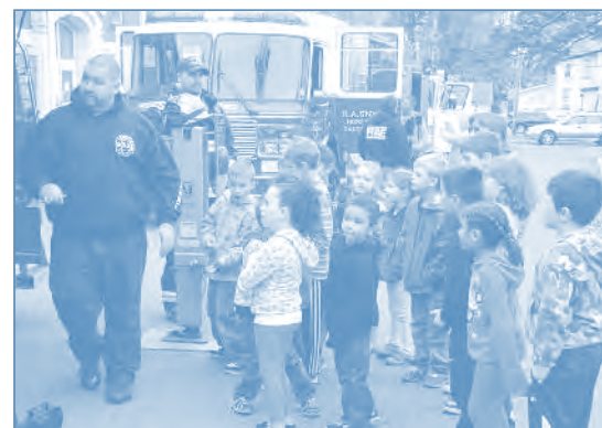
Cahill Elementary students learn about fire fighting equipment and get tips from a Saugerties Fire Department firefighter.

According to the National Fire Protection Association (NFPA), "Fire Prevention Week was established to commemorate the Great Chicago Fire, the tragic 1871 conflagration that killed more than 250 people, left 100,000 homeless, destroyed more than 17,400 structures and burned more than 2,000 acres. The fire began on October 8, but continued into and did most of its damage on October 9, 1871."