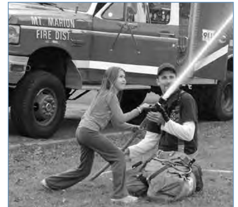
A Mt. Marion Fire Department volunteer shows a student what it feels like operating one of the fire truck's water hoses.

However, this date also marks another disaster, one even larger and more deadly than the Great Chicago Fire. The Peshtigo Fire, a devastating fire that burned down more than 1.2 million acres in Northeast Wisconsin, also occurred on October 8, 1871 and was responsible for leaving 16 towns smoldering in ashes and taking the lives of 1,152 people.