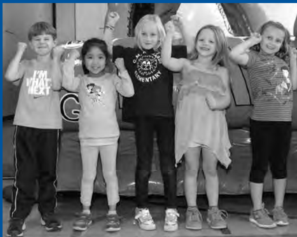
Riccardi Elementary School students flex their muscles to raise funds.

The entire Riccardi Elementary School community—students, families, teachers, and staff—pulled together to raise money for PTA-supported events, supplies, and equipment. The second annual FUNdRUN, a health and fitness fundraising event that took place through the month of September, raised more than $10,000.