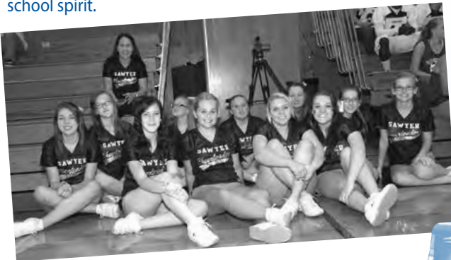
The Saugerties cheerleading squad provided plenty of encouragement at the Saugerties High School pep rally.