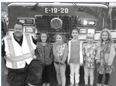
Morse Elementary students had the opportunity to see and touch the Centerville Fire Department's truck and firefighting equipment.

Local firefighters from the community visited the schools fully garbed in their full protective gear and toting their equipment. One of their goals was to encourage the children